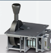
Traction Brake Controller