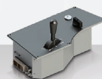
Master Control Unit