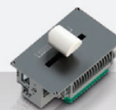
Traction Brake Controller linear

W. Gessmann GmbH P.O. Box 11 51 74207 Leingarten Eppinger Straße 221 74211 Leingarten